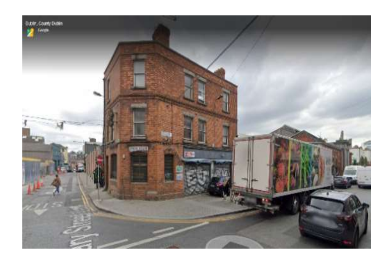
Adaptive Reuse Projects: Feasibility Complete or In-Progress: Potential Acquisitions